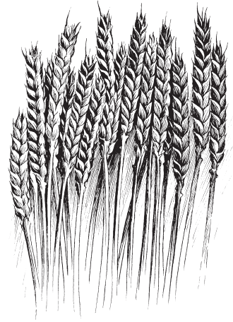
Gandum; susi pare bela' tuo jio bara'bah

njampangki'. Dennaa upa' Nabarakka'ii PUANG Allataala. Ia to basse-Na Puang Allataala te'da naballe la lako totuo, la lako to tomatemo.” 21 Nakuapa Rut, “Ia joo tau nakuanna' kumua wa'ding unapa' ade' melolang tarruh jio bara'bahna to nanii tomangamana ratu lako mangka ngasan to bara'bahna dialai jelainna.” 22 Mebalii Naomi nakua, “Io anakku', nang la'bi melo ke male bangmoko sola tuu lako pangamana baine lako bara'bahna Boas, nasaba' ia ke male lakoko bara'bahna tau laen, iamo ke nasussaiko tau jio.” 23 Susimi joo, Rut male sola tuu lako pangjama baine jio bara'bahna Boas. Ndurukki jelai jio, ratu lako mangkanna pegandumana sola pejelaian, natorro bang sola indo matuanna.