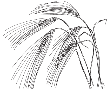
Jelai; susi ba'tan tuo jio bara'bah

2 1 Den mesa' rapunna Elimelekh, muanena Naomi, gaja sugih disanga Boas. 2 Den pissen wattu namangkada Rut joo to-Moab lako Naomi nakua, “Oo indo', la malena' lako bara'bah to nanii tau mejelai b . Mbai na den una tau mamase ngkitana' naeloranna' ndurukki to jelai polloh jio mai limanna.” Nakuamo Naomi, “Malemoko anakku!” 3 Malemi Rut lako bara'bah to nanii tau mejelai, naundi jio boko'na tuu lako tomassae'